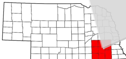
Local Distribution Area