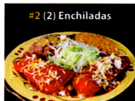
#2 (2) Enchiladas