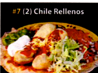
#7 (2) Chile Rellenos