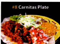
#8 Carnitas Plate