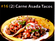
#16 (2) Carne Asada Tacos