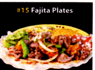
#15 Fajita Plates