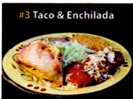
#3 Taco & Enchilada