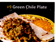
#9 Green Chile Plate