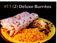
#11 (2) Deluxe Burritos