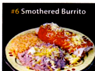
#6 Smothered Burrito