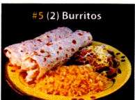
#5 (2) Burritos