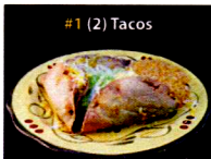
#1 (2) Tacos