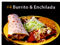
#4 Burrito & Enchilada