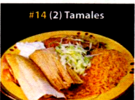
#14 (2) Tamales