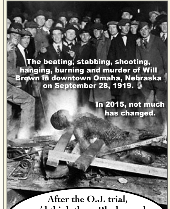
The beating, stabbing, shooting, hanging, burning and murder of Will Brown in downtown Omaha, Nebraska on September 28, 1919.